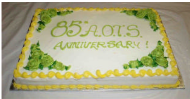
Northminster United – Oshawa, Ontario