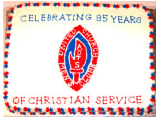
Grace United – Sarnia, Ontario