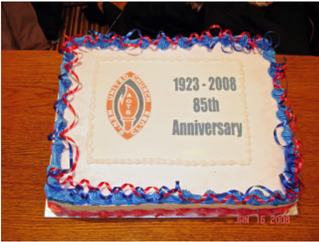
Trinity United –Newmarket, Ontario

A question: Do they only eat cake in Manitoba and Ontario? Let's hear from the rest of you!