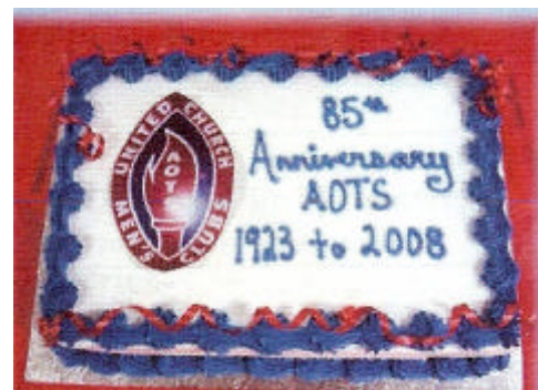
Westminster United, Belleville, Ontario