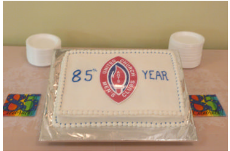
Grace United – Trenton Ontario