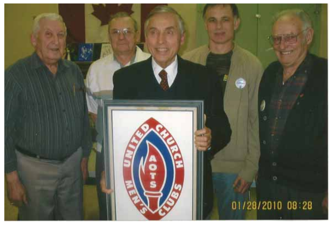
New Executive (left to right)