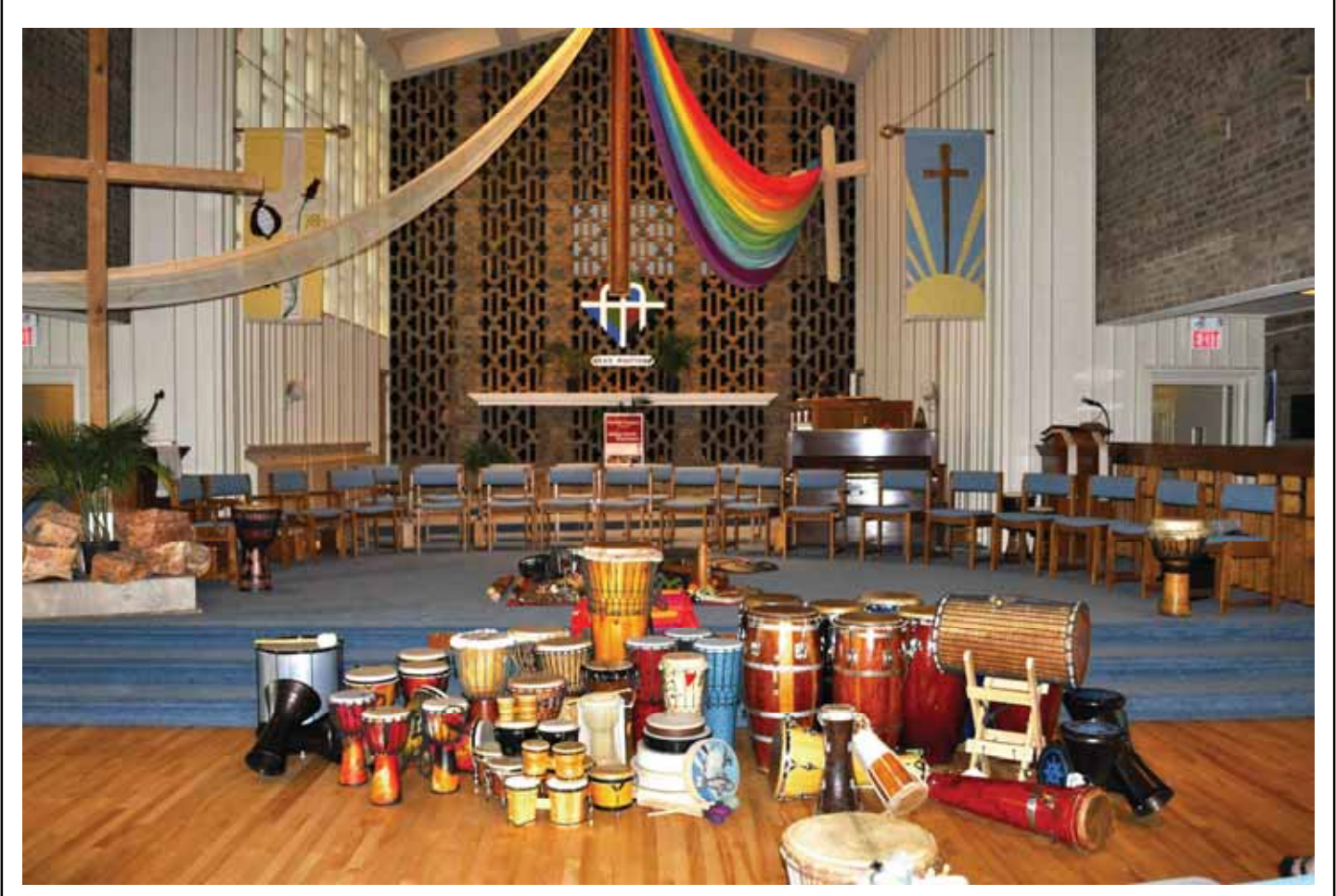
Trinity United Church, Grimsby, Ontario Abbey North Drummers all setup and ready to go

Men's Ministries The United Church of Canada