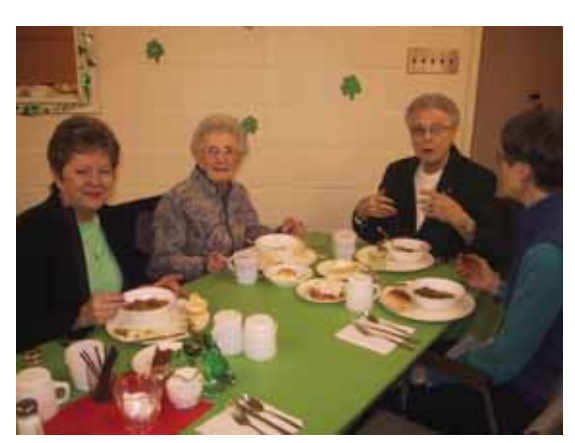
Four satisfied customers at the St. Patrick Stew Supper.