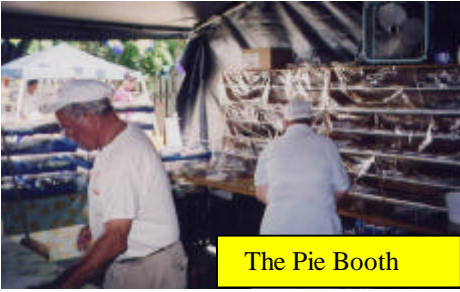
The Pie Booth

Our club has had an active year in 2007. We made 727 pies and purchased more than 400 for the pie booth at the Harrow Colchester Fall Fair.