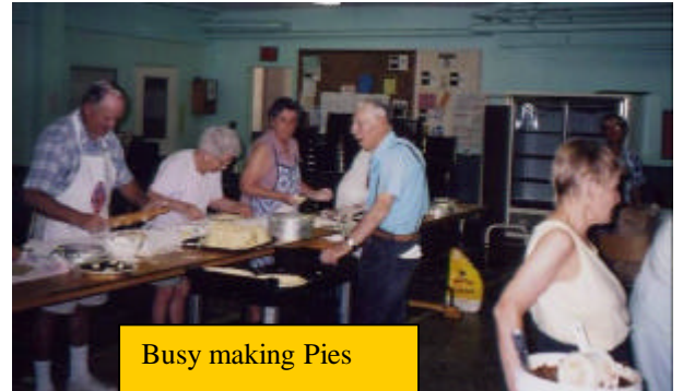
Busy making Pies

were given a slide presentation on the church's web page at www.harrowunited.org . Many members of the congregation at Harrow United Church in Harrow, ON work hard to make the booth a success.