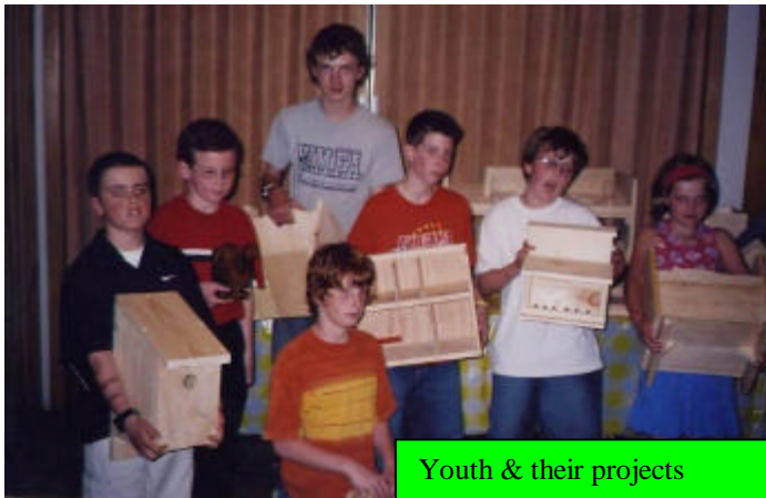
Youth & their projects

Editor's Note: Be sure to visit Harrow's web site. I am sure you will find it very interesting and informative.