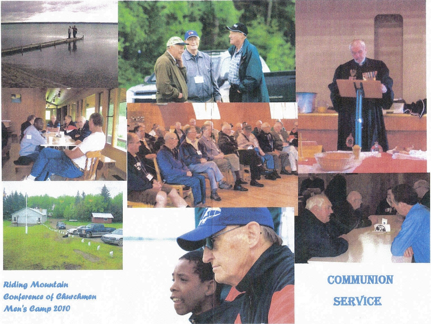
Riding Mountain Conference of Churchmen Men's Camp 2010