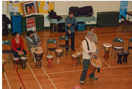
Beach UC, Toronto, Ontario