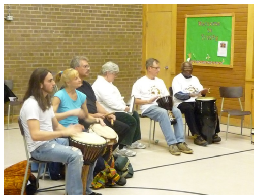
Trinity UC, Newmarket, Ontario