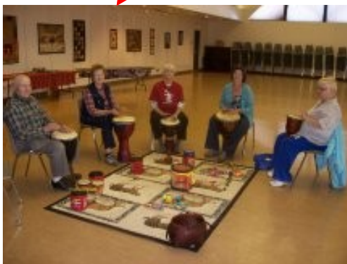
Central UC, Brandon, Manitoba