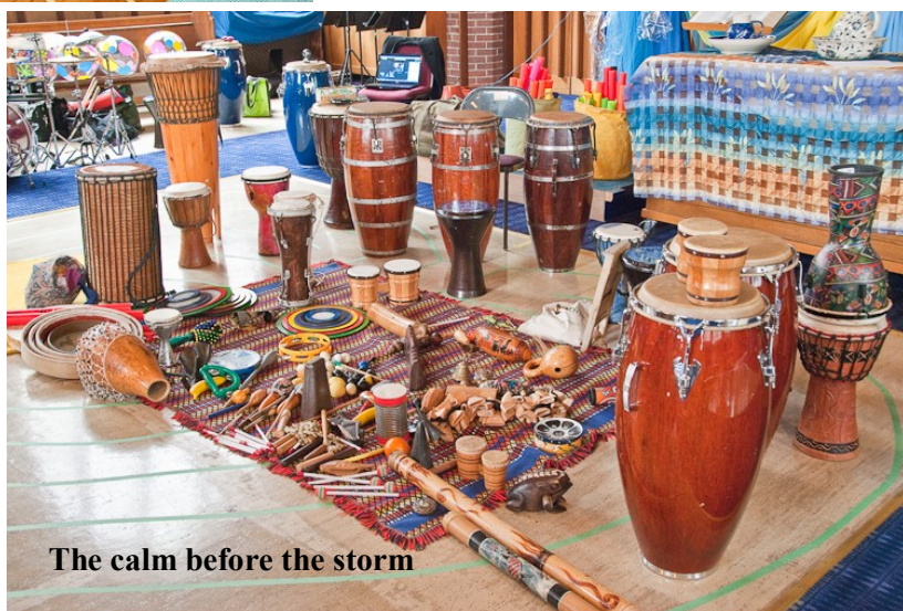
The calm before the storm

All in all, the event was very successful and a tired bunch of drummers joined the rest of the congregation on Sunday following the Drumathon to continue the drumming enthusiasm during the regular morning service and raise more money for the project.