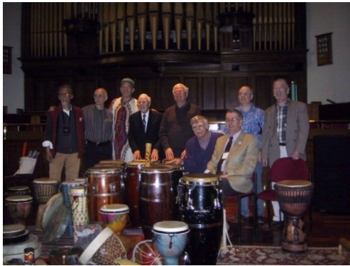
Westminster UC, Regina, Saskatchewan